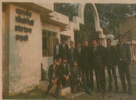
PRICEY STUDIES: IIT Roorkee is among the 23 premier tech institutes which have increased their fee by 120% to ₹2 lakh per annum