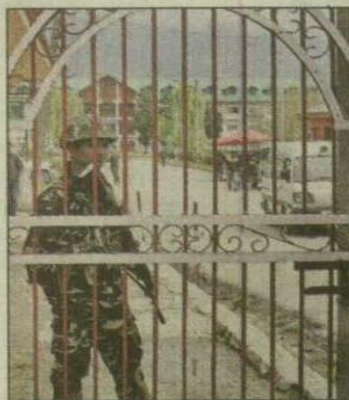
A CRPF man on the NIT campus on Thursday.

The NIT campus has been on the boil ever since Kashmiri students and outstation students clashed following India's semifinal loss to the West Indies in World T20. HRD Minister Smriti