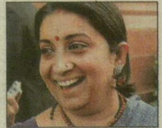
HRD Minister Smriti Irani approved the 122% hike.

THE INDIAN Institutes of Technology (IITs) are set to double their tuition fee from the academic session beginning this summer after HRD Minister Smriti Irani approved an increase of 122 per cent from Rs 90,000 to Rs 2 lakh per annum. However, the fee hike will only be applicable to students admitted under the general category.